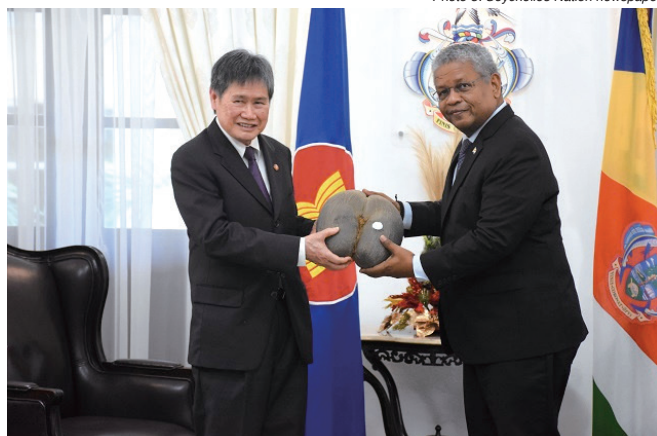
Exchange of gifts between Mr. Hoi and President Ramkalawan

strategic maneuvers. The reintroduction of multiparty politics in the Seychelles in 1992 after the fall of the Berlin Wall in 1989 was one such significant, timely and strategic readjustment.