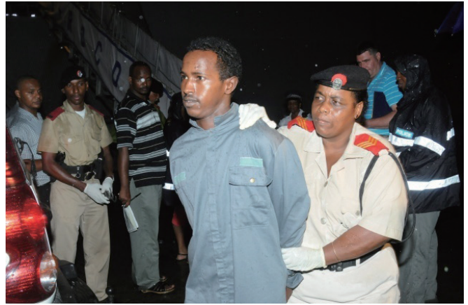
Suspected pirates apprehended by French naval ship Siroco in January 2014 are transferred to the custody of the Seychelles police.