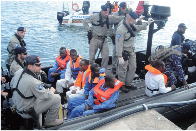
Suspected Somali pirates transferred to Seychelles